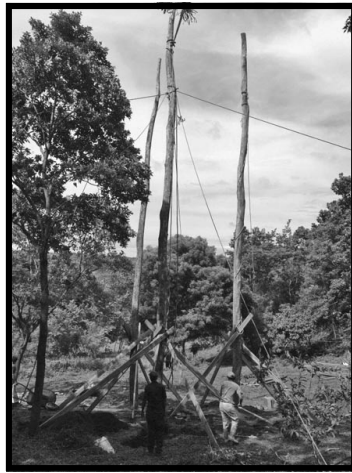
Step 2: Set those posts vertical