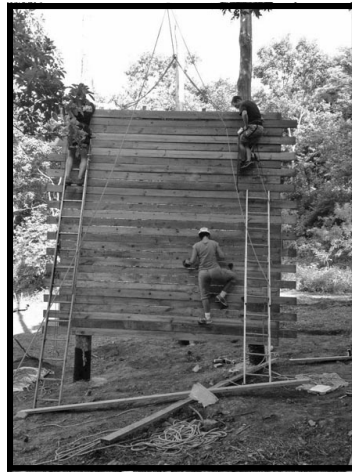
Step 3: Install planks and fixtures